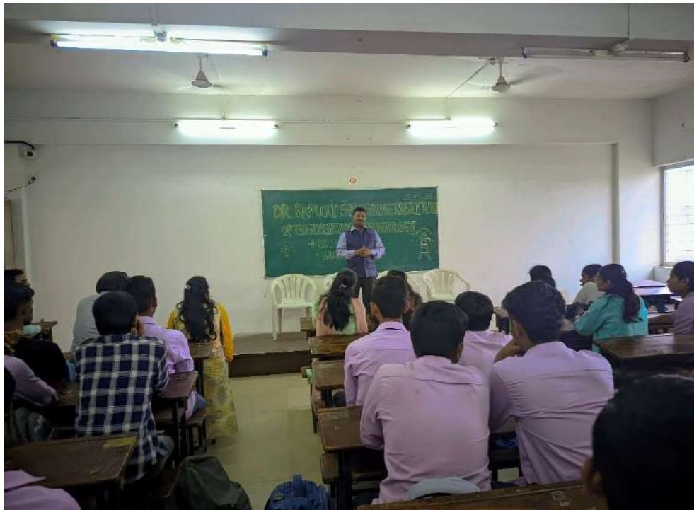
Guest Interaction With Students