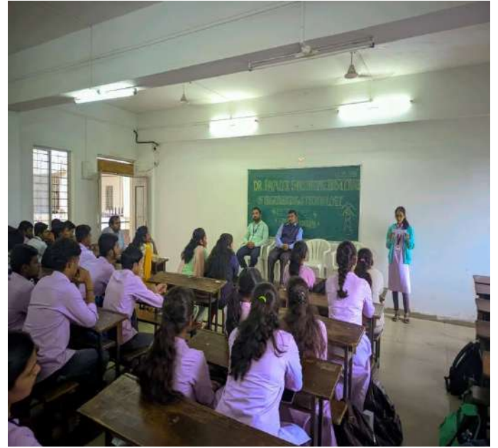
Student Speech on occasion