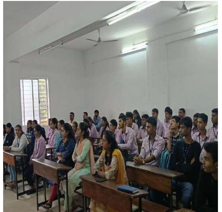
Students and Teachers Participation