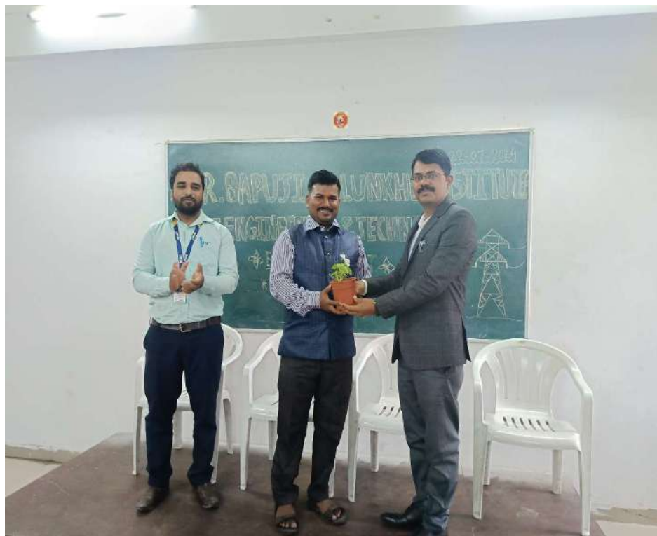
Welcome of Guest by Principal Sir

Some of the photographs while delivering the lecture are as follows: